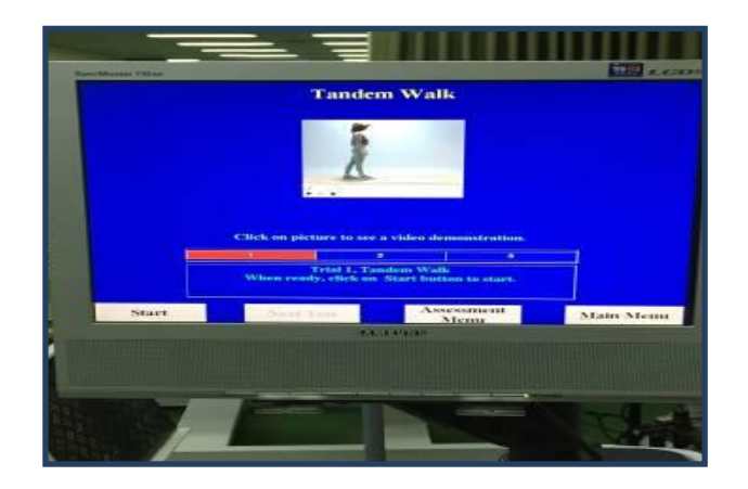
Figure (1):Tandem walk Test Assessment

The TW is a performance test that measures the stability and speed of the subject's gaitwhile walk heel to toe from one end of the forceplate to the other as quickly as possible and then stop,was done in 3 trails, it measures the average step width on the force plate (cm), walk speed (cm/sec), and the amount of end sway of COG during tandem walk along a line on the force plate<sup>(15)</sup>. (°/sec)( Fig.1 ).